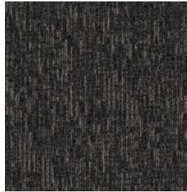
Tote Bag 400076