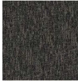
Fresh Eyes 400072