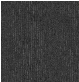
Tour Guide 400080