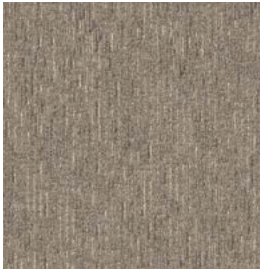
Ticket Stubs 400070