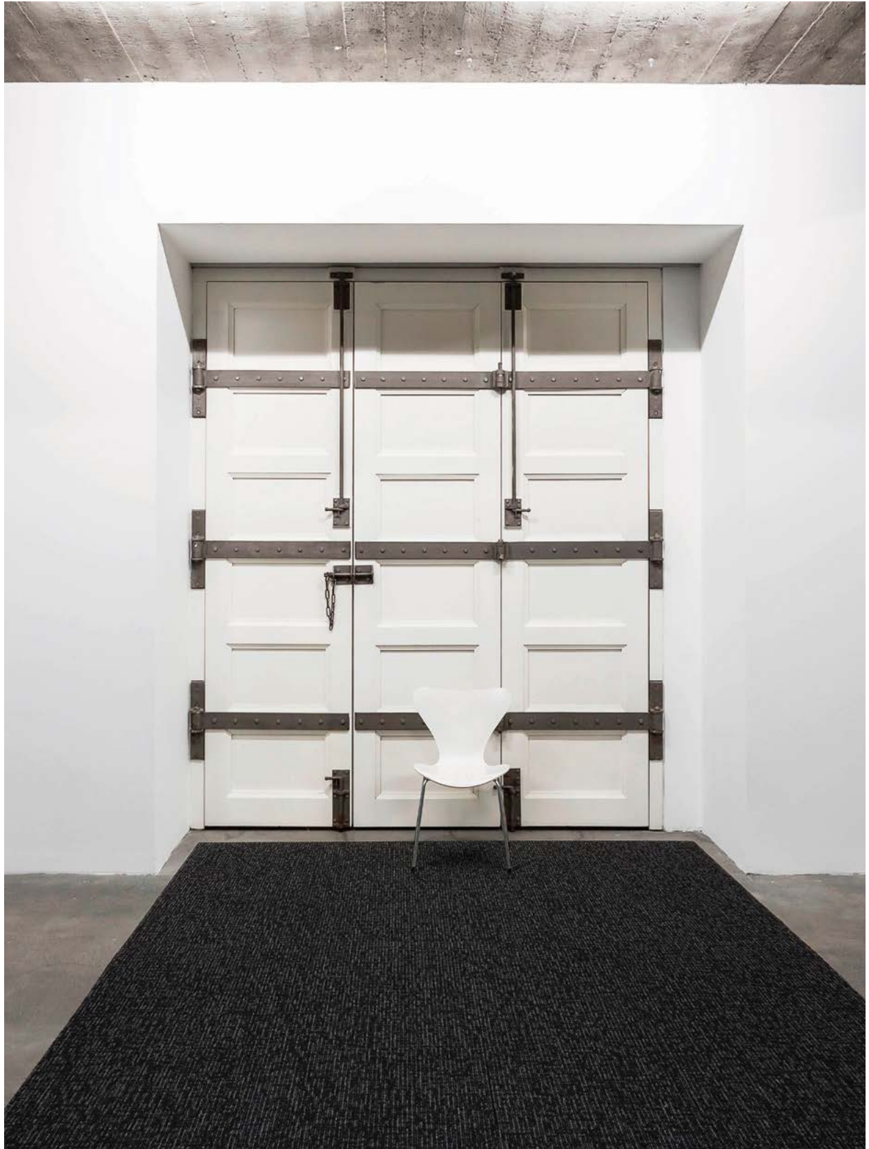
FREE DAY™ 6AFDT4, WALKING MAP 400077, 18 IN X 36 IN - MONOLITHIC