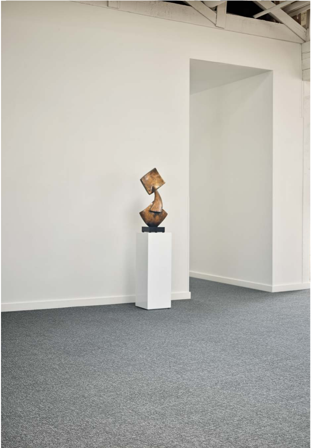
FREE DAY 6AFDT4, DISTRICT 400079, 24 IN X 24 IN - ASHLAR