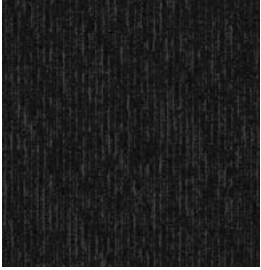
Walking Map 400077