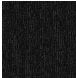
Metro Card 400081

Style Number 6AFDT4 Product Construction Tufted Textured Loop Fiber Bentley Premium™ Nylon Dye Method Solution Dyed