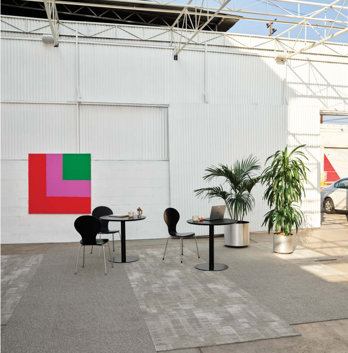
FREE DAY 6AFDT4, AND POP-UP SHOP™ 6APP20, POSTCARDS 400074, 18 IN X 36 IN - MONOLITHIC